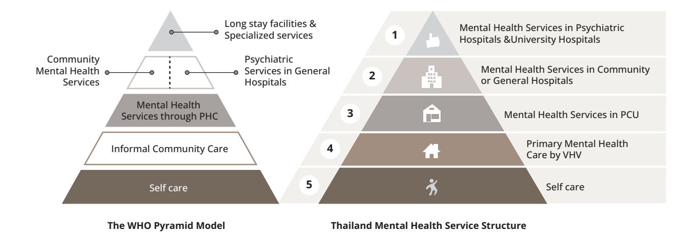
Figure 2. Structure of mental health services in Thailand compared to the WHO pyramid model [adapted from reference number 1].

Note: PHC=Primary Health Care; PCU=Primary care unit; VHV=Village Health Volunteers.