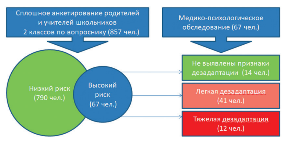
Figure 1. The overall results of the predictive value assessment study of school maladaptation in second grade students (N=857)

A statistical analysis of the differences in the calculated indicator of the individual risk level of school maladaptation according to parents and teachers in the subgroups of children with identified school maladaptation and with no signs of maladaptation (according to in-depth medicopsychological examination) using variance analysis (ANOVA) allowed to determine