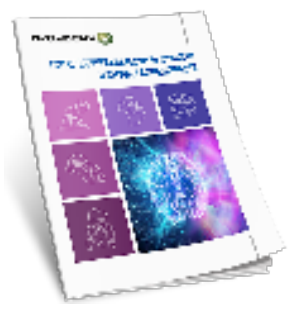
Psychological resources of the individual and the challenges of the present time