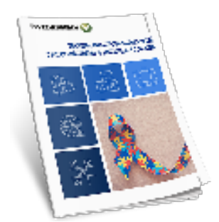
Support technologies of children with autism spectrum disorders