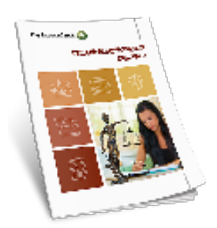
Forensic psychological examination