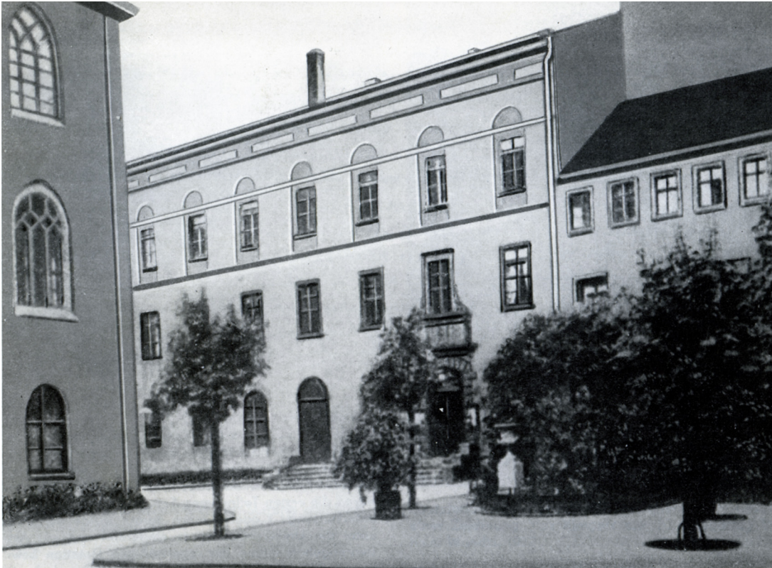
Figure 1. The "Trierianum" building where the first laboratory of psychology was elaborated in Leipzig University at 1879. (Wundt with his pupils in the Institute of Psychology 1912).

and Binet-Simon's intelligence scale was created, which opened a new era in human factor assessment. Later it was standardized by Terman in Stanford University and got the title the Stanford-Binet's test .