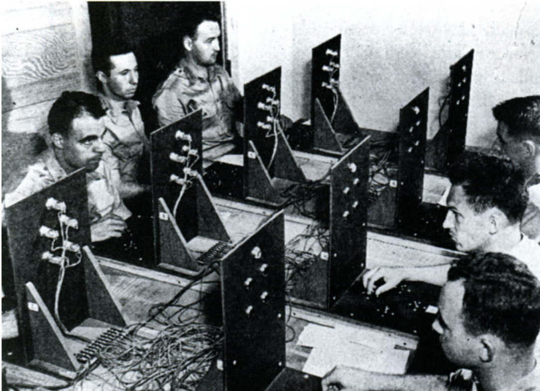
Figure 4. Group testing of complex reaction times (U.S. Air Force).

Some orders to psychologists came as the result of technogenic disasters. For example, the famous German psychologist from Wurzburg Karl Marbe was invited to investigate the big railway accident with many victims in the south of Germany (Müllheim in Baden) in 1912. He was able to imitate the actions of the train drivers in the situation prior to the accident. The analysis of these actions later became a well-founded basis for the court decision. This study provided a standard for the elaboration of the drivers' selection system and the development of a new applied psychology field.