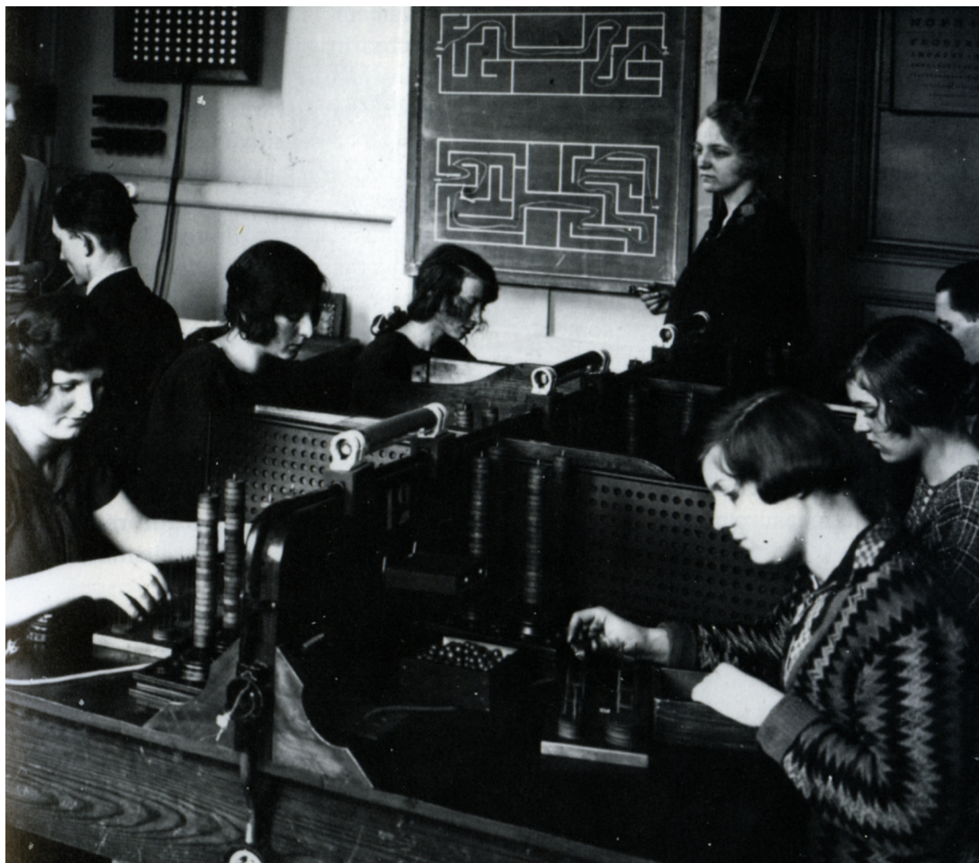
Figure 3. Psychotechnical assessment of female factory workers at the "Philips" Psychotechnical laboratory in Eindhoven.

Social order on psychological study and service was shaped in other societal fields too. At the beginning of the XX c. the issue of reliability of witness's evidence in court became very topical in Germany and then in Switzerland, France, and the USA. William Stern published for more than three years a journal on the topic emphasizing the unreliability of children's eyewitness narratives. In the USA Münsterberg discussed a full complex of psychological factors which influenced judicial decisions in his book On the Witness Stand (1908) describing very impressive experiments and data on unreliability of witnesses' statements.