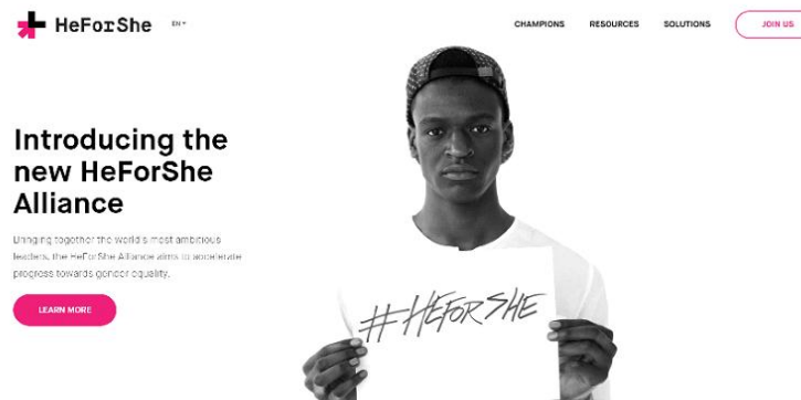
Figure 1. #HeForShe homepage

From an examination of #HeForShe's published materials and an exploration of the website, it is apparent that the designers share many of the marketing strategies of some of their corporate partners (Schroeder, Salzer-Mörling, and Askegaard 2006; Ng and Koller 2013). The site uses state-of-the-art web design: it opens with a video that features male characters, many black, who hold the #HeForShe slogan (figure one):